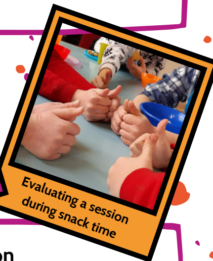
Evaluating a session during snack time