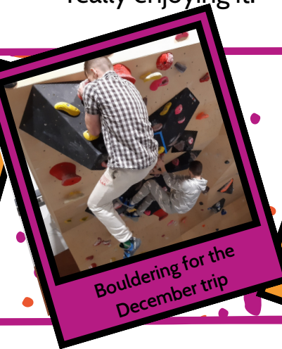
Bouldering for the December trip