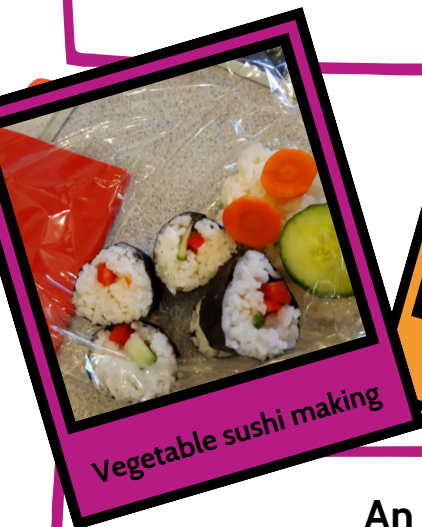
Vegetable sushi making

I was really nervous before starting, I was crying and shaking but by my third session I got used to it. Now I am really enjoying it.